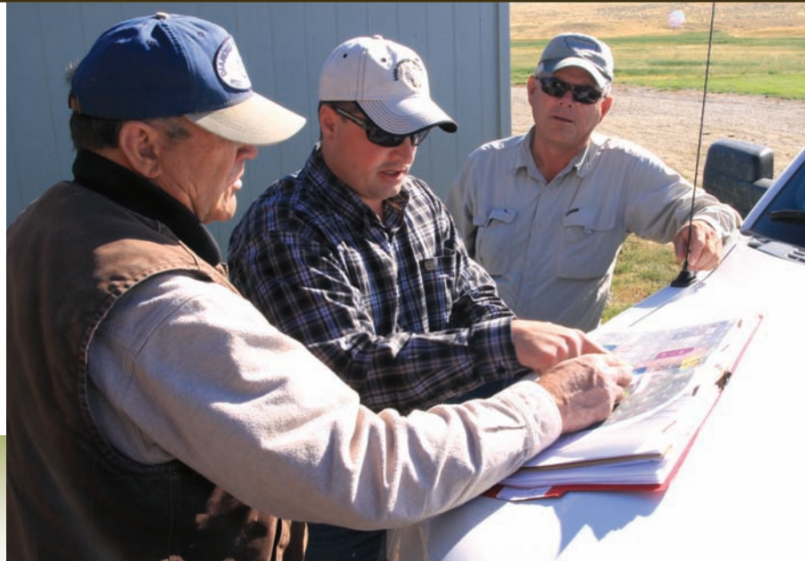
Ranchers and NRCS staff discuss a grazing rotation plan.