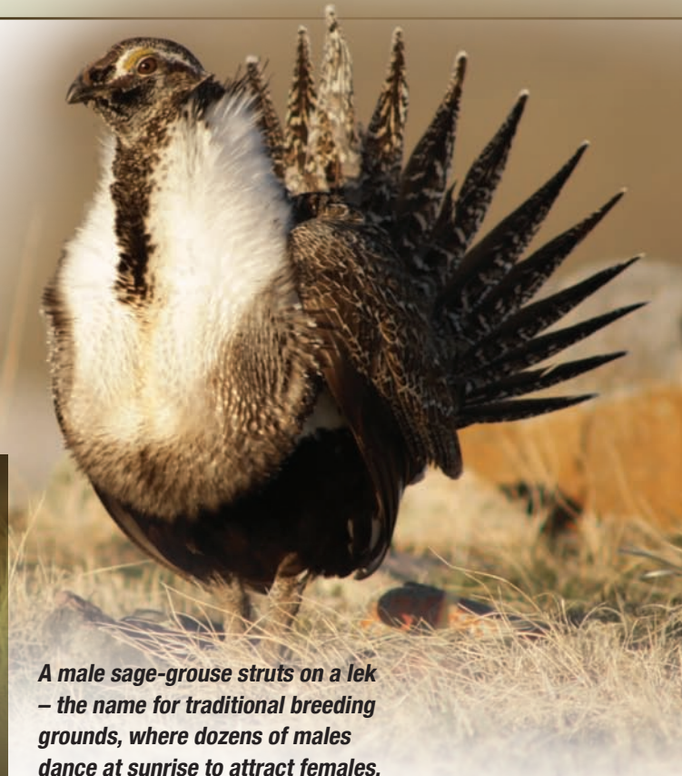
A male sage-grouse struts on a lek – the name for traditional breeding grounds, where dozens of males dance at sunrise to attract females.