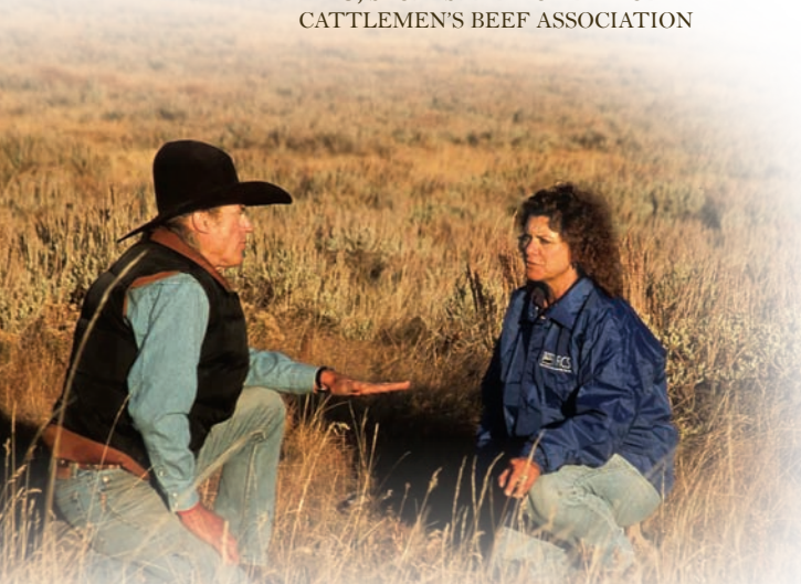
The partner positions will work closely with private landowners who have volunteered to participate in SGI.