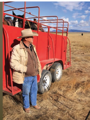
Ranchers are important to sage-grouse recovery. About 40 percent of the birds' sagebrush-dominated habitat lies on privately owned lands.