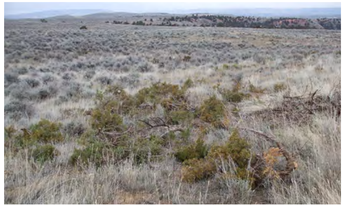
Example of lop-and-scatter cutting.