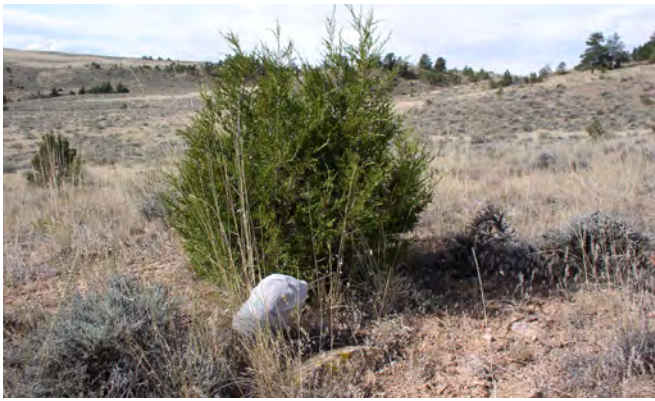
Junipers increasing on sagebrush grassland.